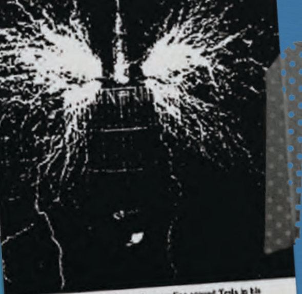
Discharge of several million volts cascading around Tesla in his Colorado Springs laboratory. The roar that accompanied such discharges could be heard ten miles away.